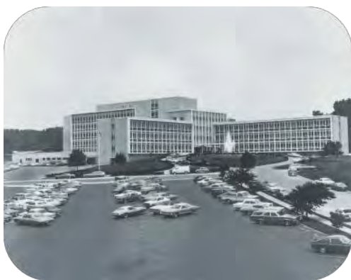
Madison Hospital Circa 1977

For more information regarding the SDA church visit - www.adventist.org .