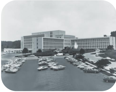
Madison Hospital Circa 1977