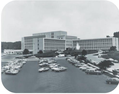
Madison Hospital Circa 1977